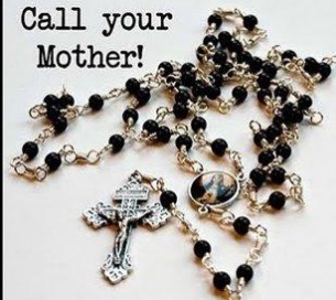
She hasn't heard from you in decades!